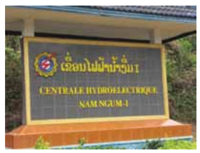
Nam Ngum 1

An L&S-7500 distributing valve replaced the Hitachi mechanical governor in the cabinet. Numerous mechanical components were removed for this replacement, which freed-up a lot of space in the cabinet. The L&S-7500 is a distributing valve with high flow capacity that is designed specifically to work with hydroelectric turbine controllers of low to medium operating pressure.