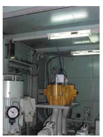
After retrofit - L&S Manifold & Distributing Valve mounted in the existing governor cabinet