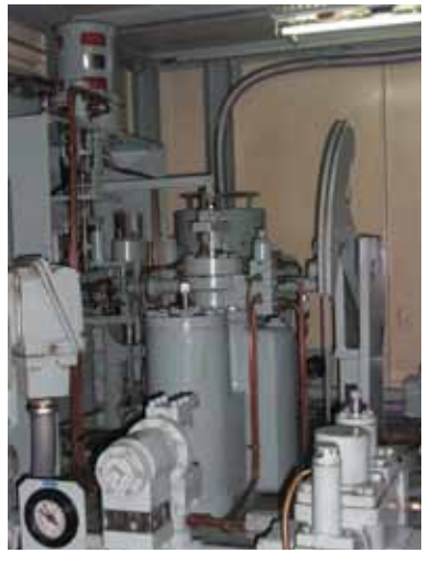
Before Retrofit - Hitachi Mechanical Cabinet Actuator

The commissioning at the Nam Ngum 1 plant was a success story. The L&S MRT with the new distributing valve illustrated that PM Control's solution could meet all operational and technical requirements of the hydro turbine application.